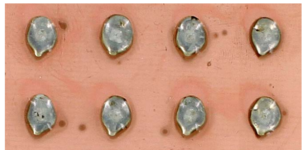
Spitting Kristall 611