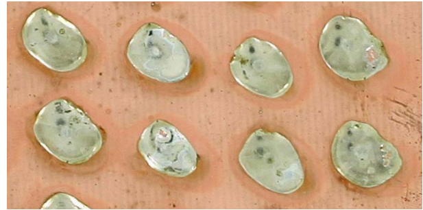
Contamination Kristall 611

Specially soldering robot with integrated solder wire feeding unit adopted to the laboratory requirements.