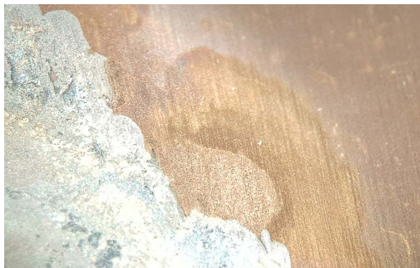
Results: Copper corrosion (Classified=L)

Major Corrosion: Development of green-blue discoloration/corrosion with observation of pitting of the copper panel.