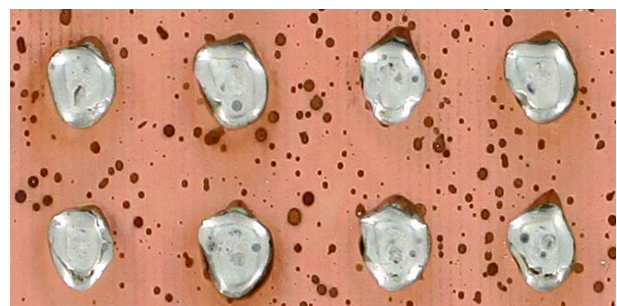
Spitting conventional solder wire