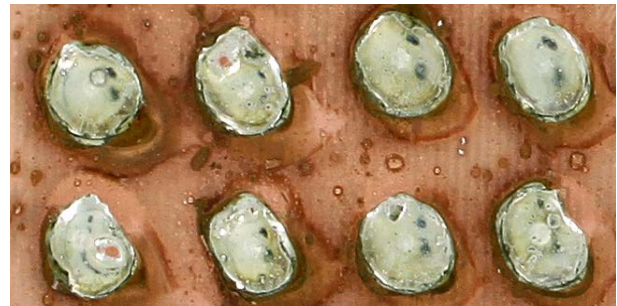
Contamination conventional solder wire